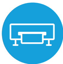
Digital Print Media