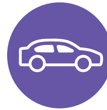
Sign & Reflective